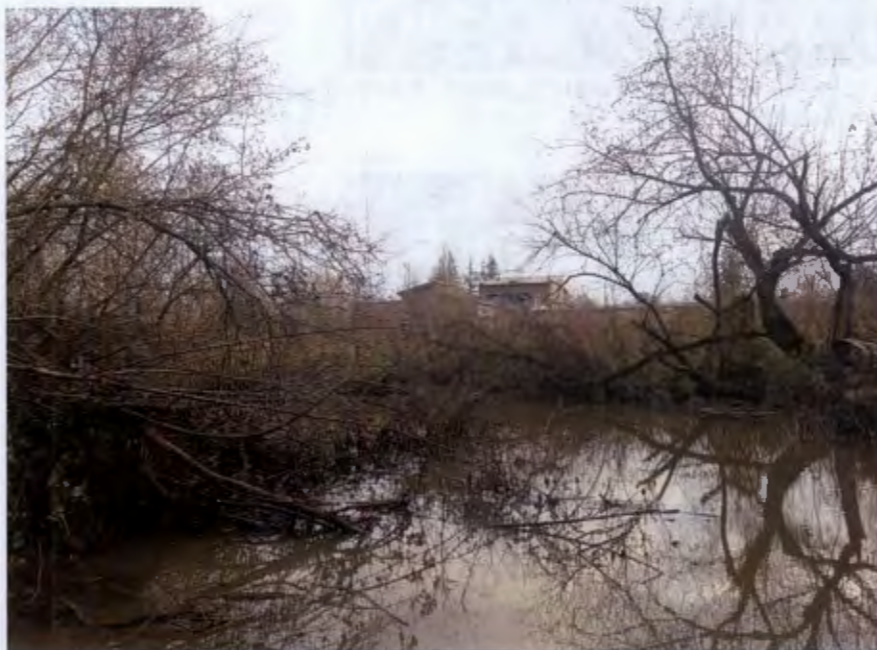
Figure 4. Cox Creek Vegetation Photo Point #1- 4 th season of plant establishment Winter 2016 (High water overtopping culvert made it impossible to reach other side of creek)