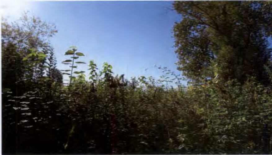
Figure 3. Cox Creek Confluence Vegetation Photo Point #1 – 4 th season of plant establishment Summer 2016