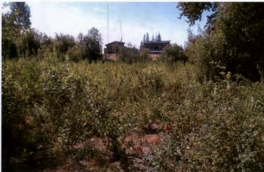
Figure 2. Cox Creek Confluence vegetation photo point#1 - AFTER. Post site prep, planting, and 2 seasons of plant establishment, Summer 2014.