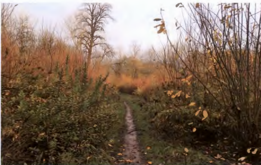
Figure 6. Cox Creek Revegetation Photo Point #2—4 th season of plant establishment Winter 2016.