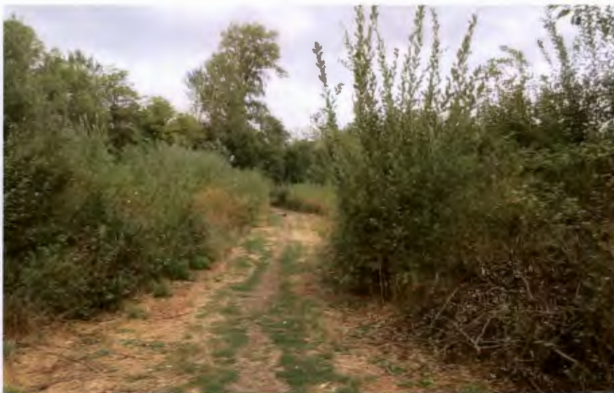
Figure 5. Cox Creek Vegetation Photo Point #2—4 th season of plant establishment Summer 2016.