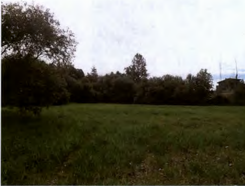
Figure 1. Cox Creek Confluence vegetation photo point #1- BEFORE. Post flail mow, pre reed canarygrass spray, Summer 2012.