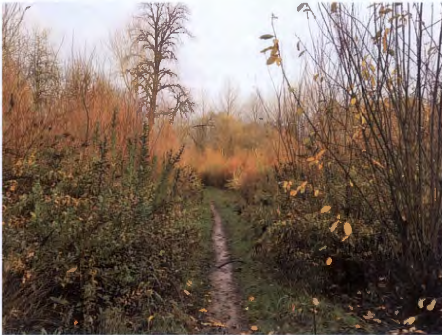
Figure 1. Cox Creek Confluence vegetation photo point December 1, 2016